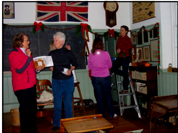
Decisions, decisions, decisions!