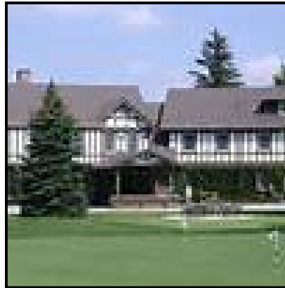
Site of the Credit Indian School today. The Mississauga Golf and Country Club on Mississauga Road and the Queen Elizabeth Way

James Magrath was an Anglican clergyman and a magistrate for the area as well as the leading landowner in Springfield (later Erindale). In March 1828 he wrote that out of a total population of 200 in the village there were 35 boys and 36 girls attending school. The school was free.