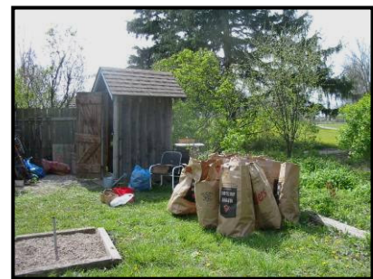
There are always lots of bags full of debris at the end of a Saturday morning cleanup