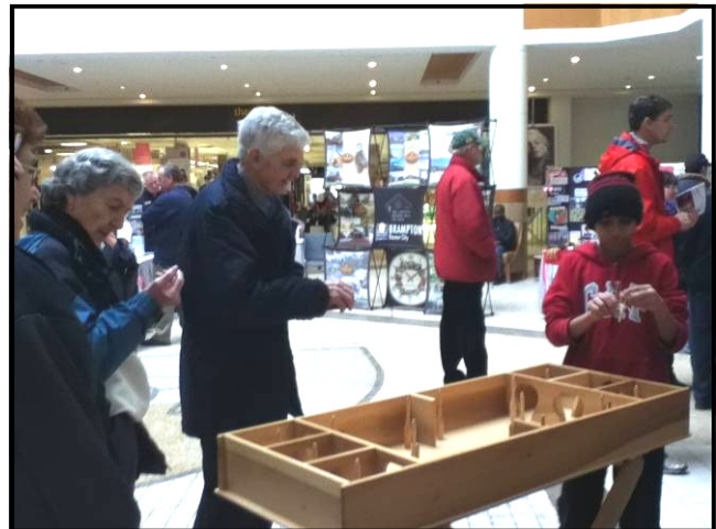
The skittles game kept everyone amused— and frustrated!