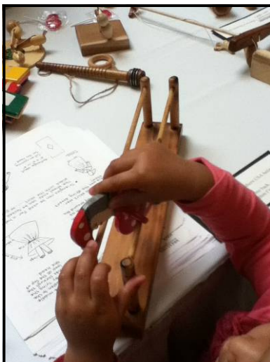
Battery-free toys fascinate