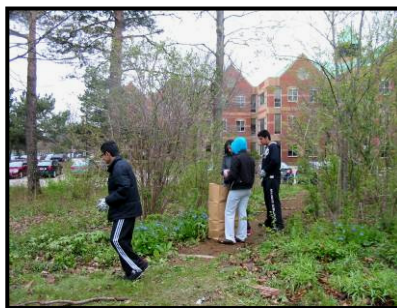
Secondary school students gain community service hours while they help in the garden