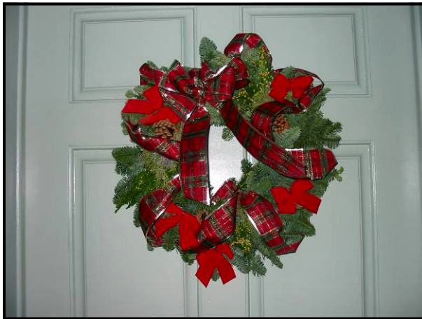
A welcoming wreath